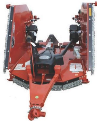
Unit shown with extra equipment.

Double chain guards are highly recommended if the intended use is for highway, right of way, parks, greenbelt mowing, and all other applications where humans, dwellings, vehicles, or livestock could be within 300 feet of the mower.