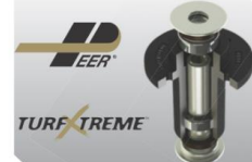
PEER Spindles - Maintenance free with Contamination Exclusion Technology