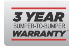
*Unlimited hour limited warranty, see dealer for complete warranty details