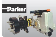
Parker HTJ - Smooth steering and 1,000 hour oil change intervals