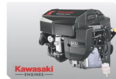
Kawasaki Engines - Reliable power to tackle the toughest jobs