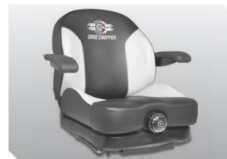
Suspension Seat - Full suspension for ultimate comfort all day long