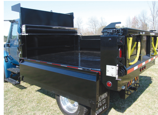
Optional drop sides in the down position. The side easily unlatches with a single handle and folds down lower than the body floor. Body shown with additional options.