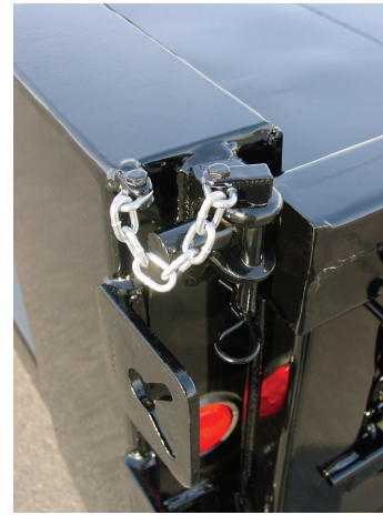
Double acting tailgate with drop pin upper hardware

36" cab shield, 8 gauge sides, 3/16" one piece floor, fold down 13" sides, 18" sides, Zinc powder primer, quick release upper hardware.