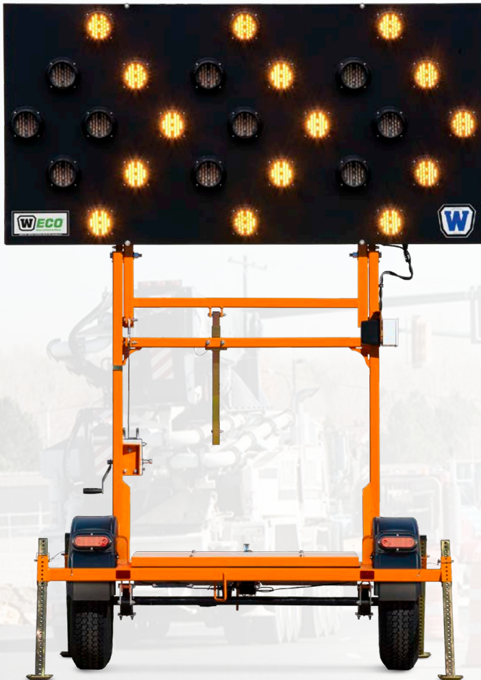
FOLDING ARROW BOARD