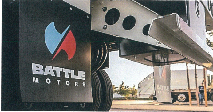
Cast steel, tubular crossmembers provide consistent strength fore and aft, side-to-side