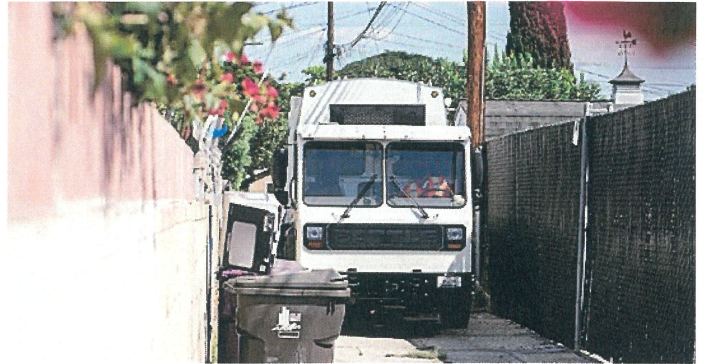
82" cab width engineered to be 12" narrower than our standard chassis for tight applications