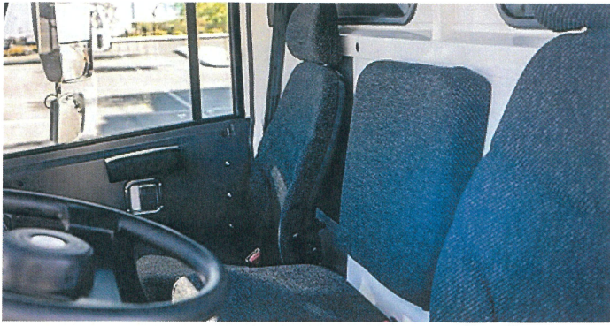
Seating for three all forward facing with seat belts