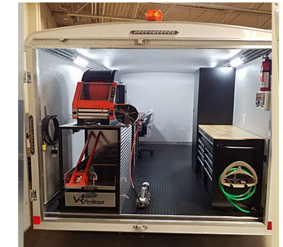
TRAILER - ECONOMY