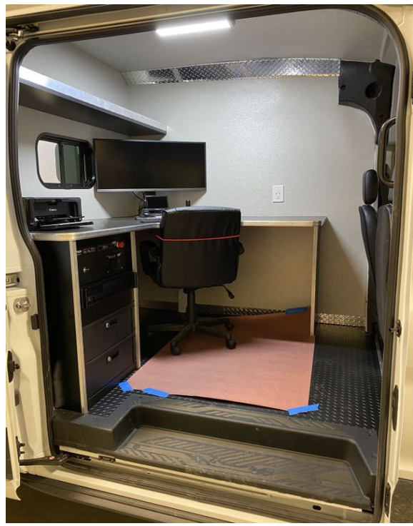
PREMIUM CARGO VAN - GAS