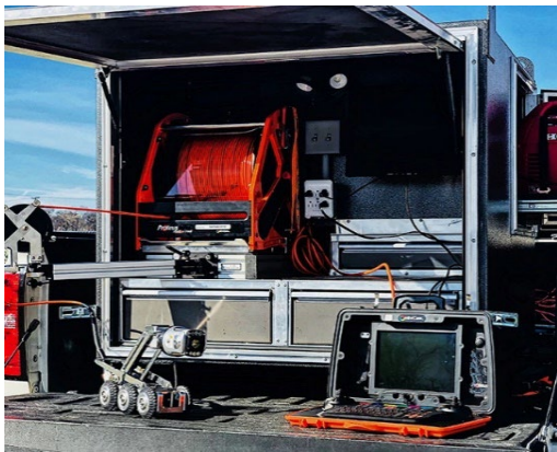
PORTABLE BOX - UTV