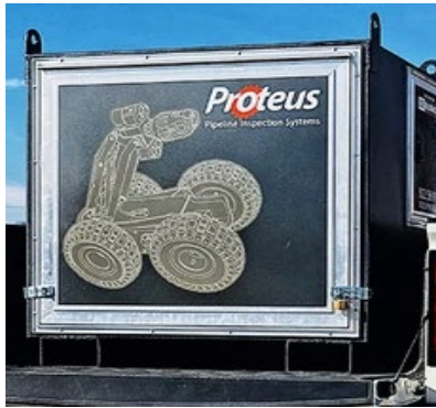
PORTABLE BOX - PICKUP