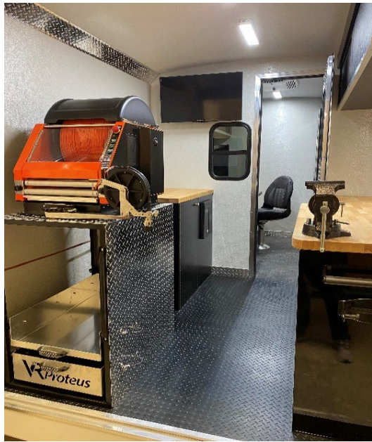
TRAILER - PREMIUM