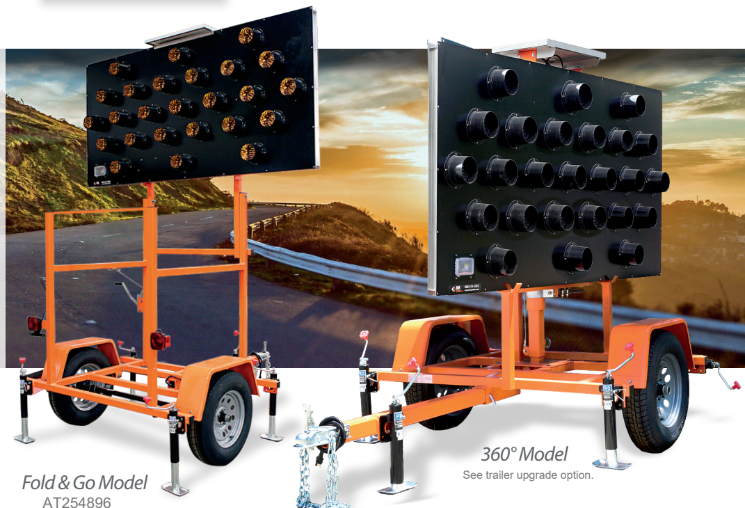
Fold & Go Model AT254896