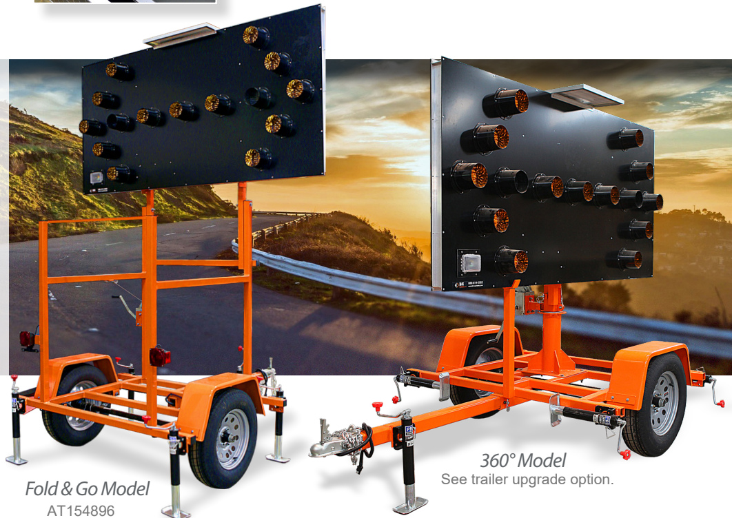
Fold & Go Model AT154896