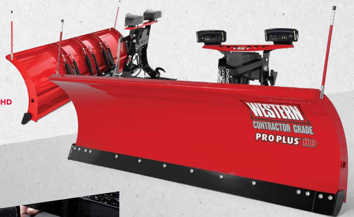
SNOWPLOW PICTURED: PRO PLUS® HD

When you're looking to keep it simple for snow removal, our WESTERN® full line of straight blade plows are what you're looking for. With limited moving parts and the ability to raise, lower, and angle left and right—these plows move snow efficiently with little to go wrong.