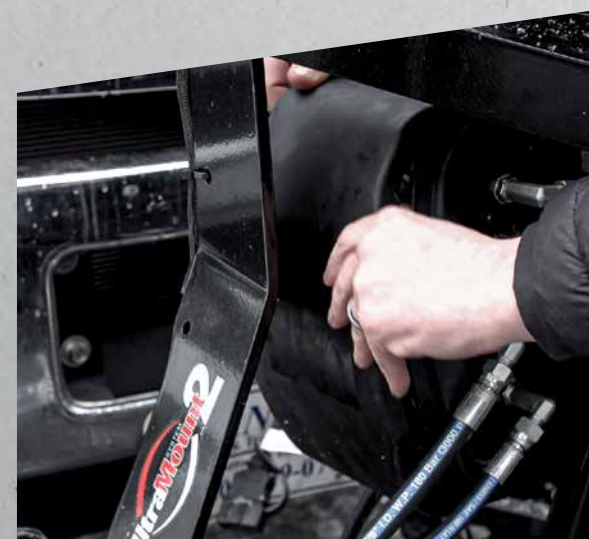
HYDRAULIC BLADE POSITION Control lift and lower functionality and angle left and right from inside the truck cab.