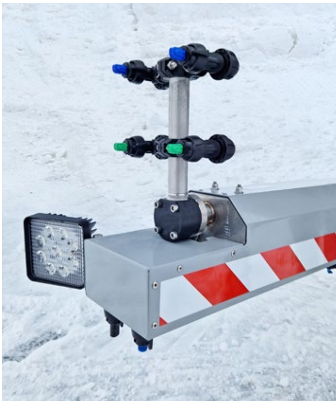
2-lane, 90" wide spray bar with double spray, side nozzles and LED work light (white)