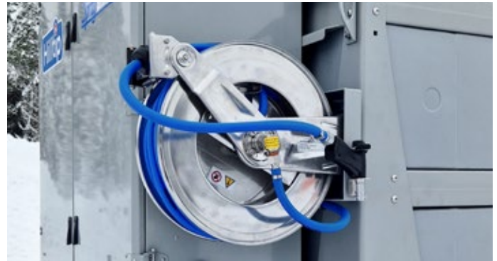
65' hose reel (optional)