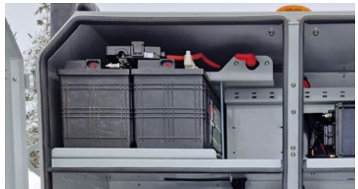
24V Battery (2 x 115Ah) power kit (optional)