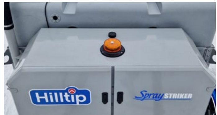
Beacon warning light