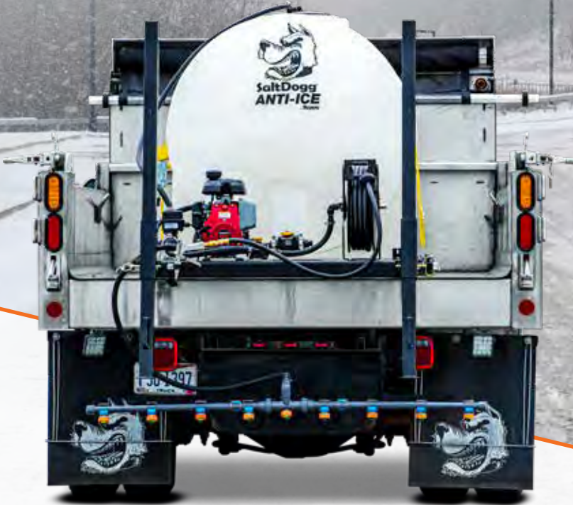
6191121 shown above with optional 3039076 hose reel and spray gun kit

Powered by Honda® Engines: 5 HP for 185 GPM Systems/2.8 HP for 25 GPM Systems