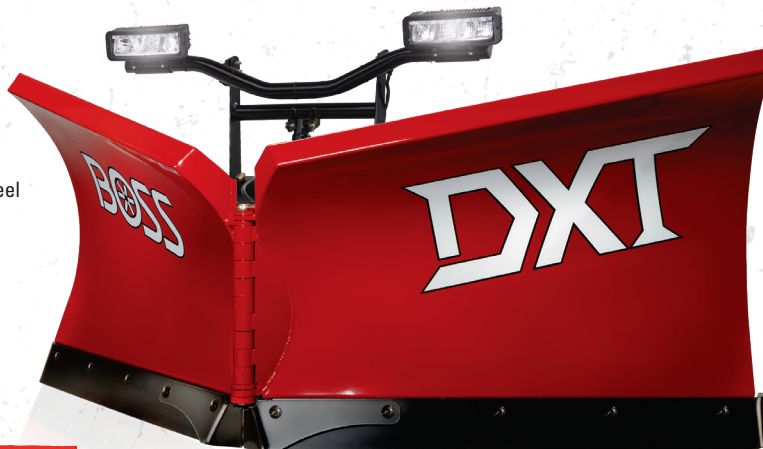
10' DXT Steel