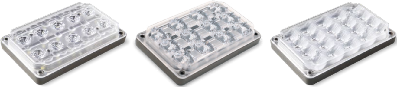
Backup & Warning

Light Types: Available for use as backup, backup with warning, scene, stop/tail/turn, turn and warning