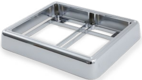
Heavy-duty, metal housings

Replace (x) for bezel finish = (B for Black, C for Chrome)