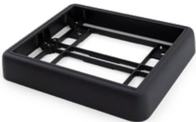
Heavy-duty, metal housings

● ● ● ● ○ To configure product to your exact needs, visit soundoffsignal.com or contact customer service.