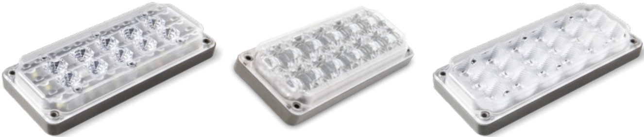
Backup & Warning

Light Types: Available for use as backup, backup with warning, scene, stop/tail/turn, turn and warning