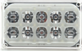
Backup w/ Warning