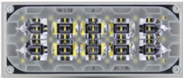
Backup w/ Warning