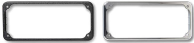
Heavy-duty, metal housings