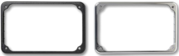
Heavy-duty, metal housings