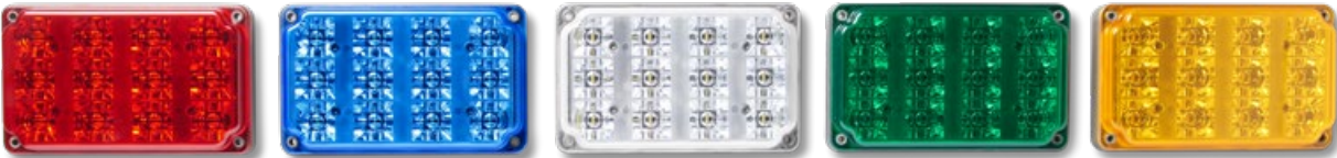
Lens Color Options