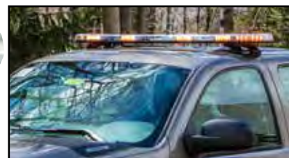
8893060 shown with mounting feet (Mounting feet and controller sold separately)