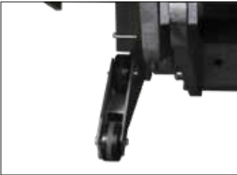
Bolt-on Parting Bar shown above.