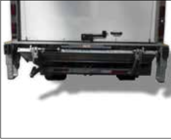
EM Series Gate in stowed position.