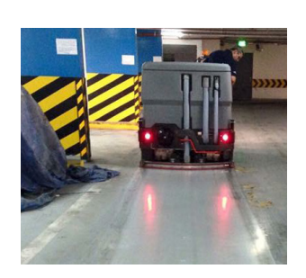
Clean and Safe Floors in a Single Pass