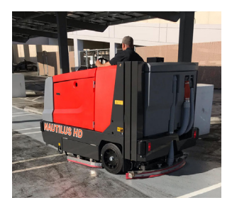
High Performance Industrial Cleaning Results