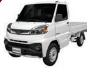
STD. CAB TRUCK

Comes with a 4-Speed Automatic Transmission, a first-of-its-kind.