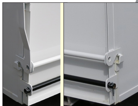
Easy to open and close latch mechanism makes closing the door simple and virtually effortless.