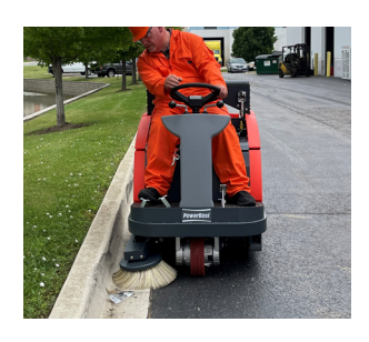
Versatile Applications From outdoor-to-indoors, the Apex 47 offers excellent performance