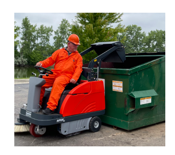
Simple Debris Disposal Easy hands free emptying with variable dump height up to 60"