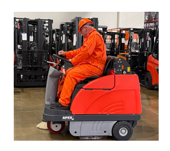
Compact Design Easy maneuverability in tight spaces