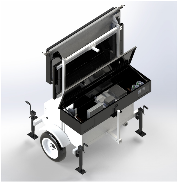
Optional external camera box

1-year warranty (three months on batteries)