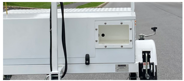
Optional recessed camera compartment