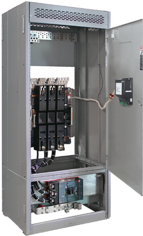
ASCO SERIES 300 SE Rated 800 amperes Type 1 enclosure

The ASCO Service Entrance Power Transfer Switch combines automatic power switching with the disconnecting, grounding, and bonding required for use as service entrance equipment. It meets all National Electrical Code® requirements for service entrance use.