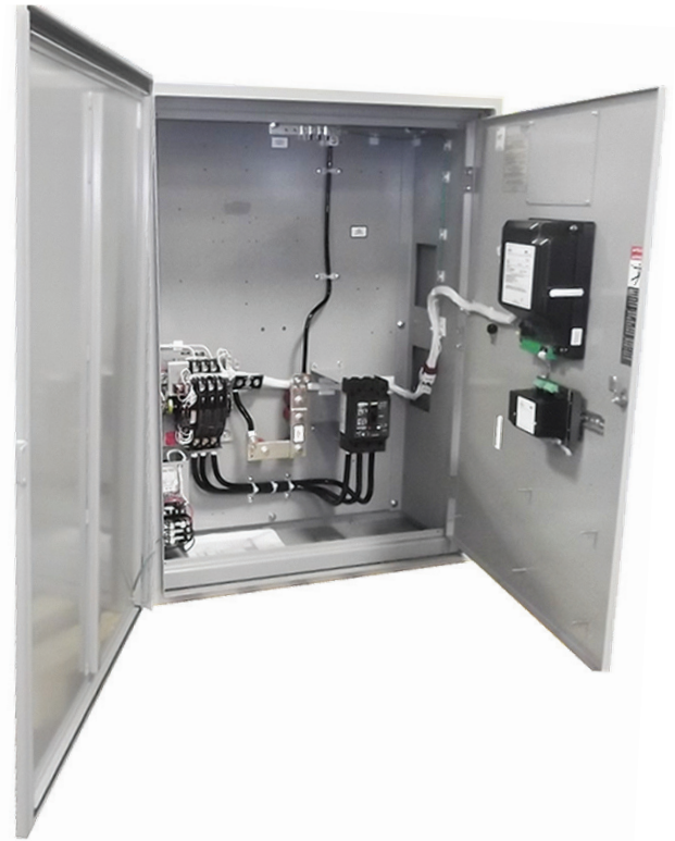
ASCO SERIES 300 SE Rated 200 amperes in Type 3R enclosure