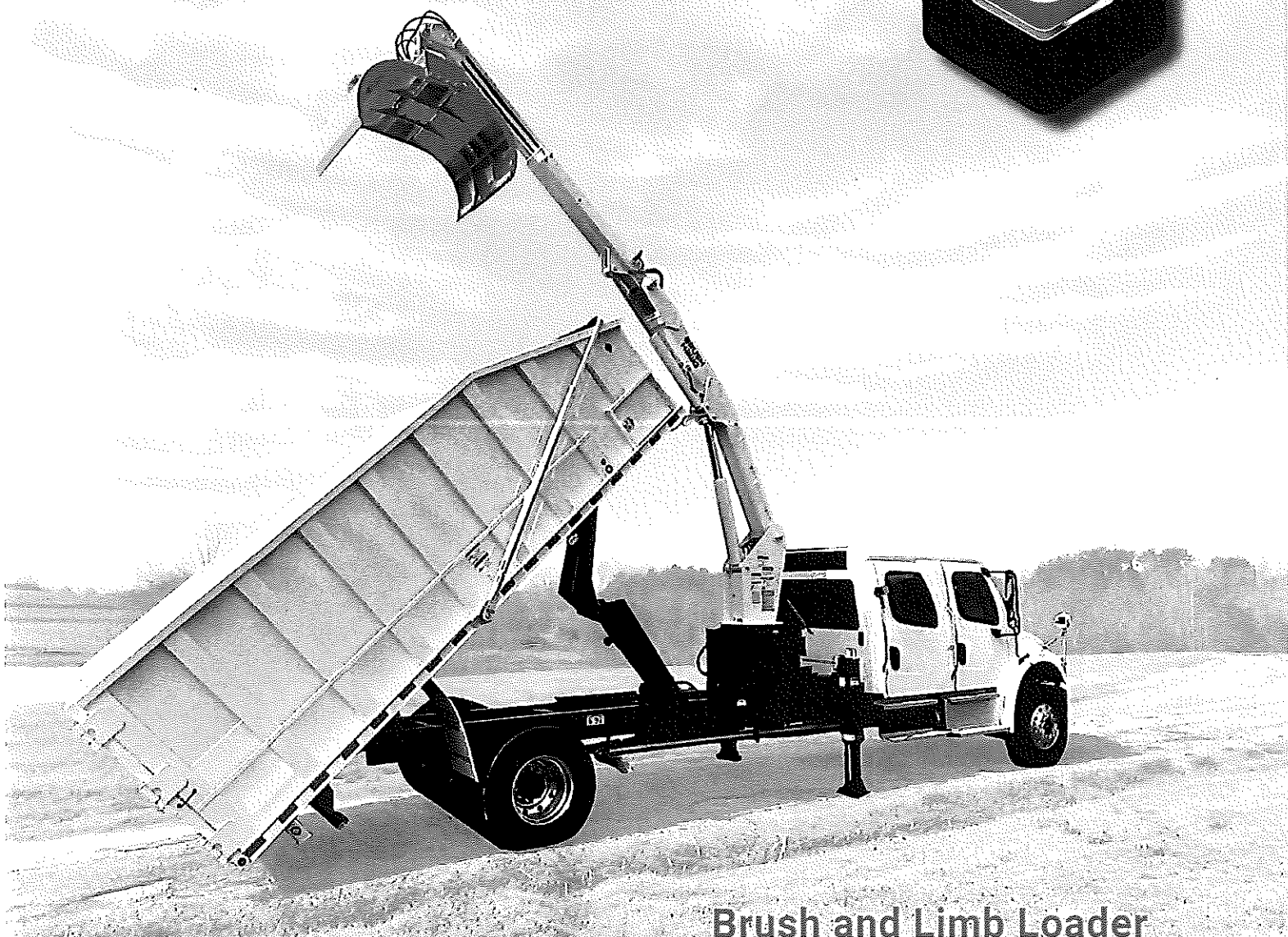
Brush and Limb Loader All Weather Cab (AWC) Model