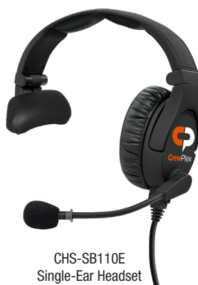
CHS-SB110E Single-Ear Headset