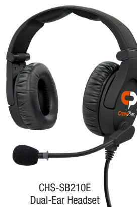
CHS-SB210E Dual-Ear Headset