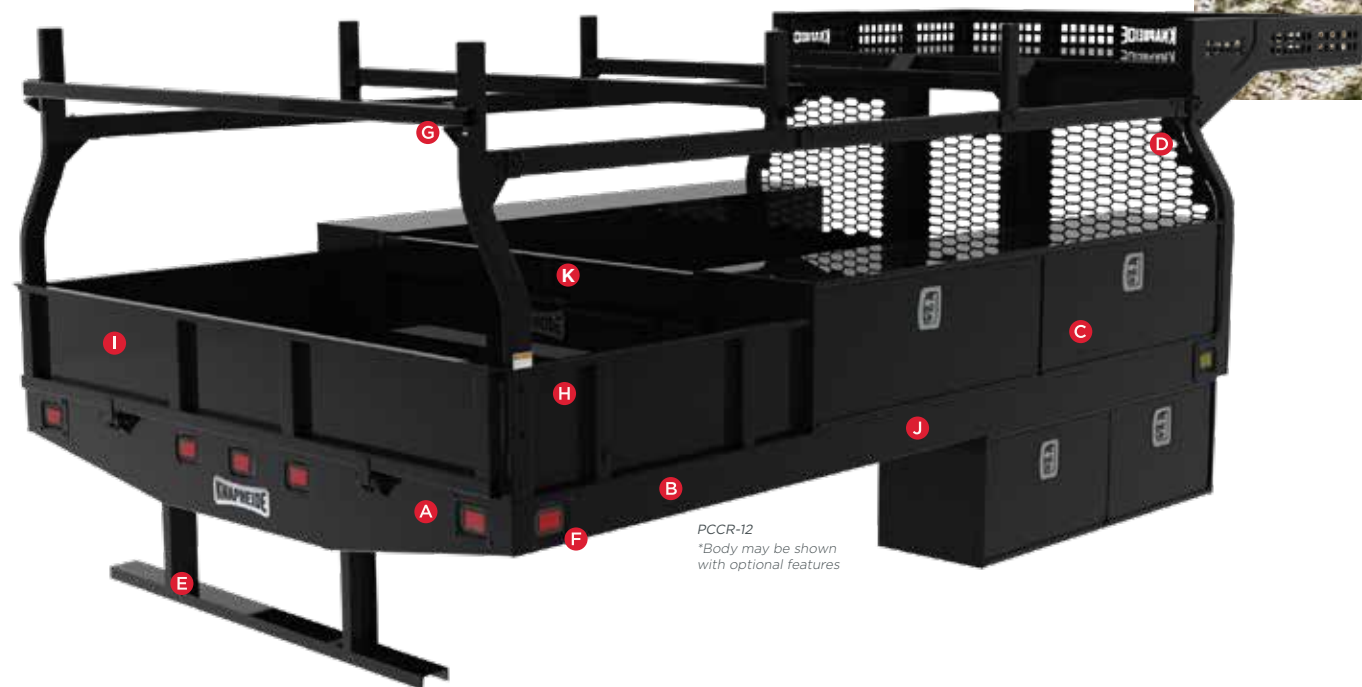
PCCR-12 *Body may be shown with optional features

Visit knapheide.com/quote and fill out the form to receive a quote and additional product information.