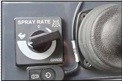
1. The spray rate rotary control

The operator controls SPECS with three main control features: