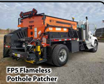
FP5 Flameless Pothole Patcher