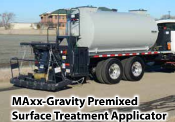
MAXx-Gravity Premixed Surface Treatment Applicator