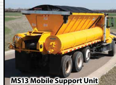
MS13 Mobile Support Unit