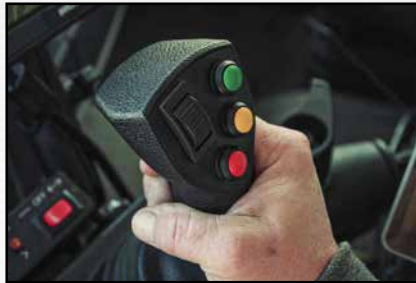
2. The joystick