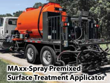
MAXx-Spray Premixed Surface Treatment Applicator