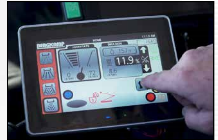
3. The touchscreen display

The spray rate rotary control directly manages aggregate output and emulsion flow rate. The joystick controls the spray boom position for left/right and up/down, output start/stop, advance to next patch step, toggle spray head oscillation, and aggregate hopper chamber selection (in the case of having dual-chamber hoppers). Buttons on the joystick, while color-coded, are also ergonomically positioned so that the operator can quickly learn to fulfill all functions by touch — without taking his/her eyes from the work at hand. The 7-inch touchscreen display provides all necessary information for the operator, including: