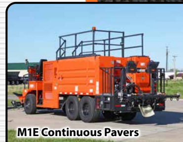
M1E Continuous Pavers