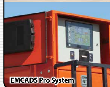
EMCADS Pro System