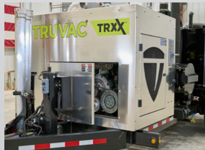
Easy access to service panel