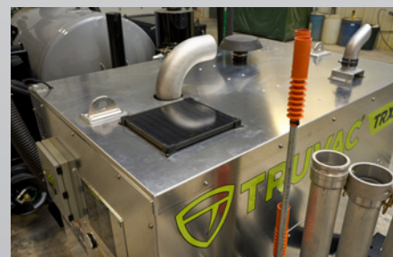
Optional solar powered battery tender