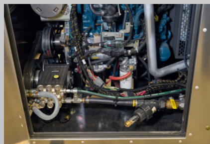
Easy access to maintenance items