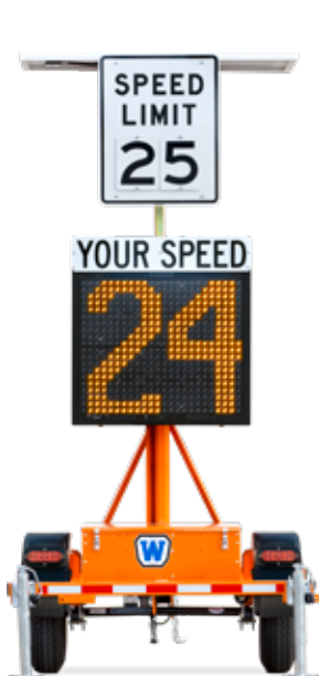
Compact Speed Trailer

Regulatory sign sizes from 24 × 30 up to 48 × 60