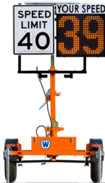
Vertical-Mast Speed Trailer