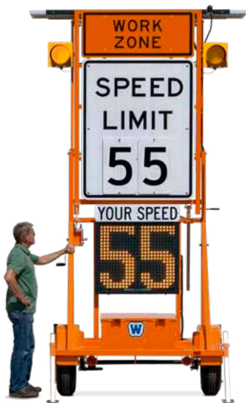
Large Folding-Frame Speed Trailer with optional flashing beacons