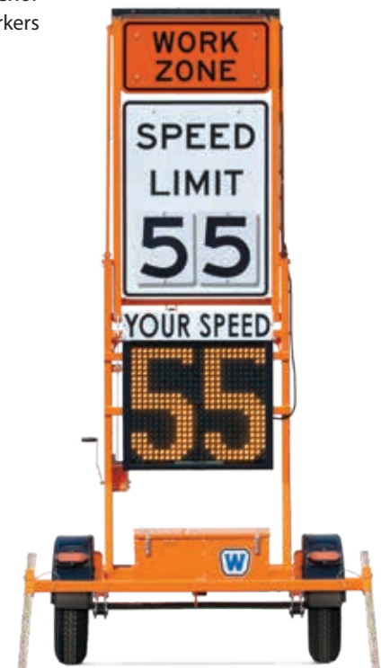
Folding-Frame Speed Trailer