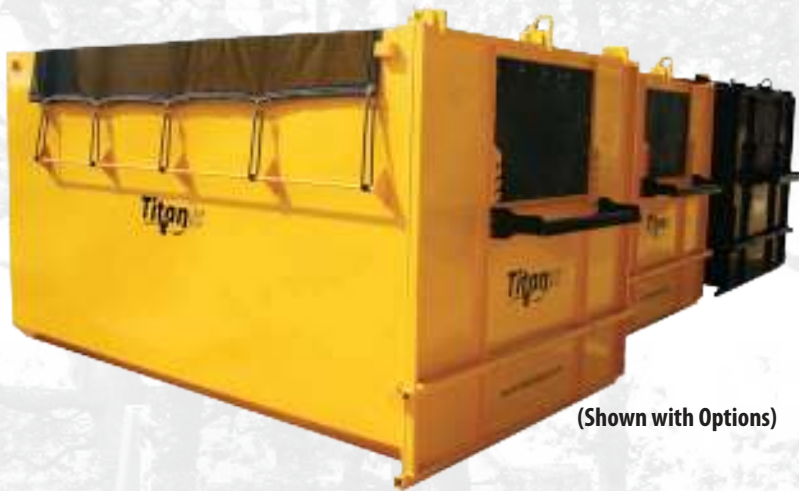
(Shown with Options)