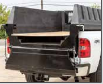
Design accommodates full sheets of plywood