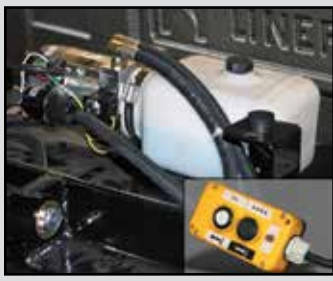
Power up & power down power unit with 10' tethered control box