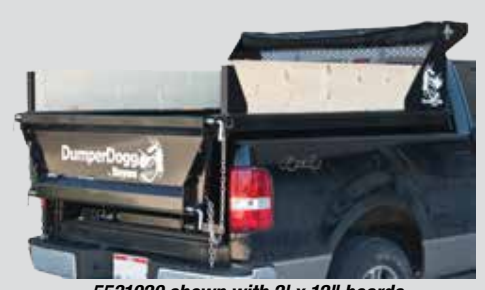
5531020 shown with 2' x 12" boards