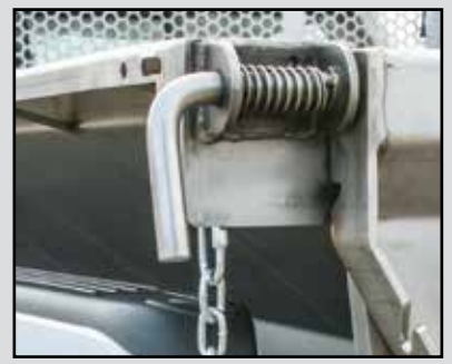
3/4" Diameter stainless steel tailgate hitch pins