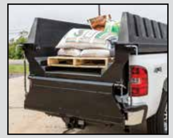
Design accommodates standard pallet