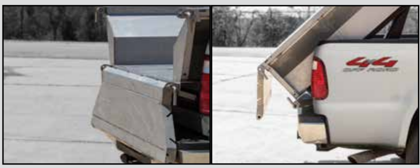
Double pivoting & removable tailgate