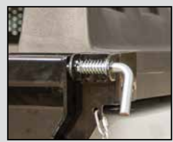
3/4" Diameter tailgate hitch pins