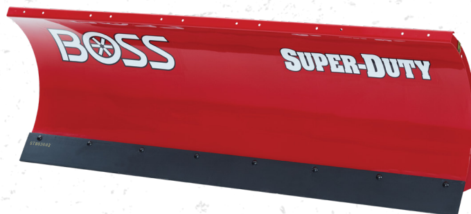
8' Super-Duty Trip-Edge Steel Skid Steer

The base angle, or cutting edge, trips back to protect the plow and truck from damage when obstacles are encountered.