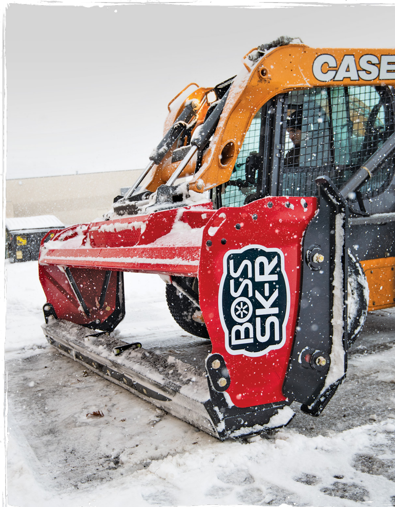
SK-R Backdrag Edge