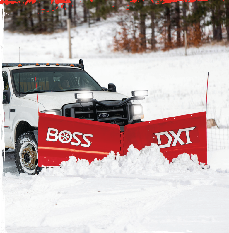
10' DXT Steel