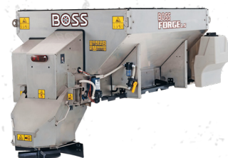
FORGE® 1.5 1.5 cubic yards of capacity (shown with pre-wet)