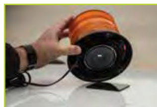
8895400 shown with SL695A beacon

Note: Allows use of magnetic light mounts even on aluminum truck cabs