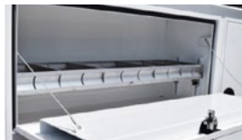
Center Compartment with Dropdown Door (showing Double Walled Doors)