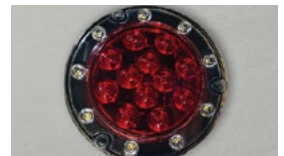
LED Ultra-thin 6" Round Stop/Tail/Turn/Backup Body Lights