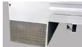
Tread Plate Rock Guards on Front Wall