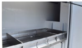
Pass Thru Compartment Shown Between Front and Middle Boxes