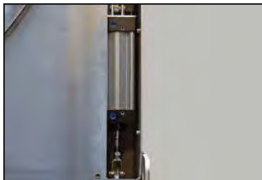
Dual air tailgate cylinders standard