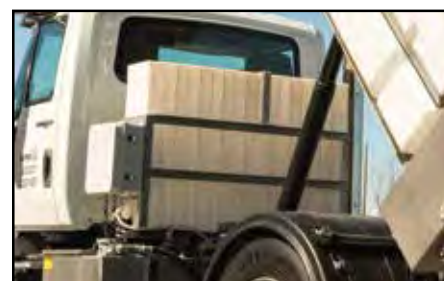
LS12 (Behind Cab Mount 120 gal.)