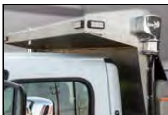
Cab shield with Tarp System