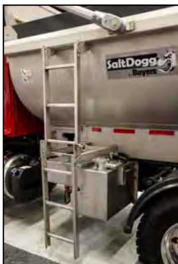
Ladder shown extended down