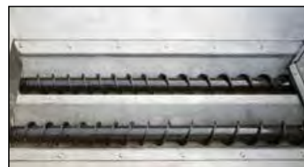
Dual 7" auger drive