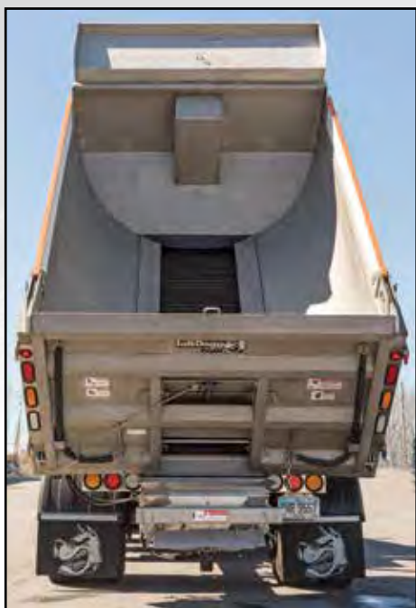
Unique, roll-formed sides and cross member-less design