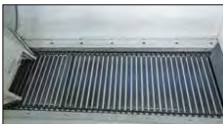
30.25" wide conveyor with 1/2" bars