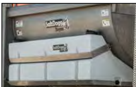
LS11 (MDS Mount two, 160 gal.) See pg. 56 for details