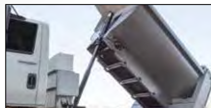
Mailhot® multi-stage, double-acting, nitrided cylinder, trunnion-mounted hoist