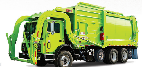
Available with 5-axle configuration