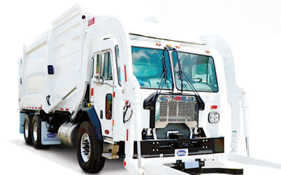
Available with commercial grabbers