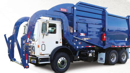
Available in 20 yard body configuration