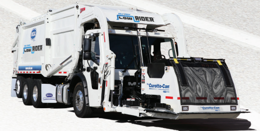
Optional Curotto-Can® Residential Package