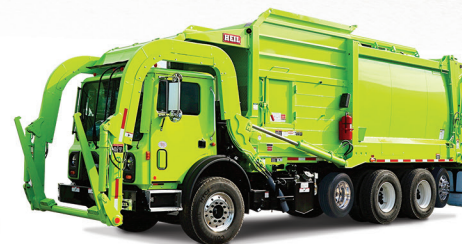
Available with 5-axle configuration