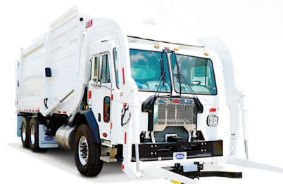
Available with commercial grabbers