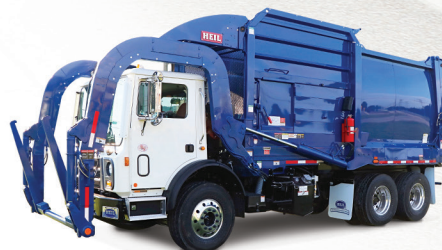
Available in 20 yard body configuration