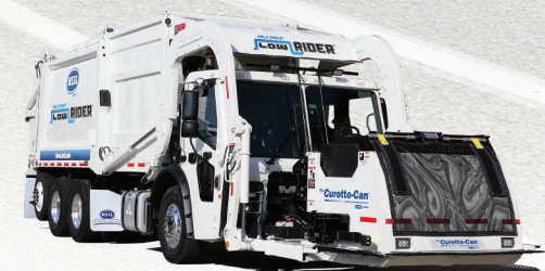
Optional Curotto-Can® Residential Package