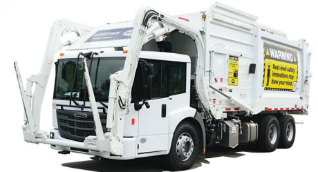
Available with articulating arms for EconicSD chassis