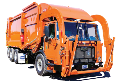
Available in lightweight Freedom body package