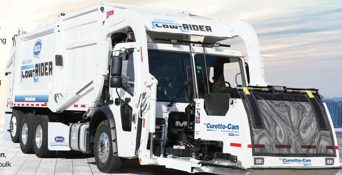
Shown with optional Half/Pack® LowRider™ Body and Curotto-Can® Residential Package

* Heil does not provide tax advice. Please consult your tax advisor regarding the specific tax implications of your selected product.