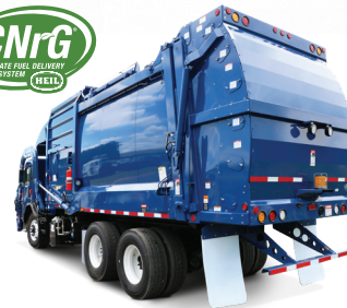
Available with optional CNRG® Tailgate