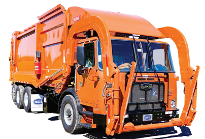
Available in lightweight Freedom body package