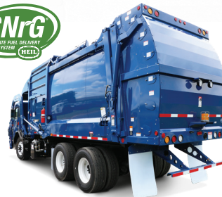
Available with optional CNRG® Tailgate