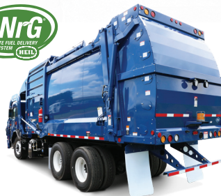
Available with optional CNRG® Tailgate