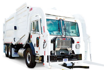
Available with Curotto® commercial grabbers