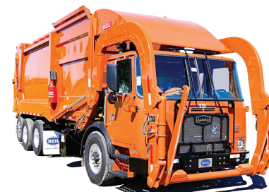
Available in lightweight Freedom body package