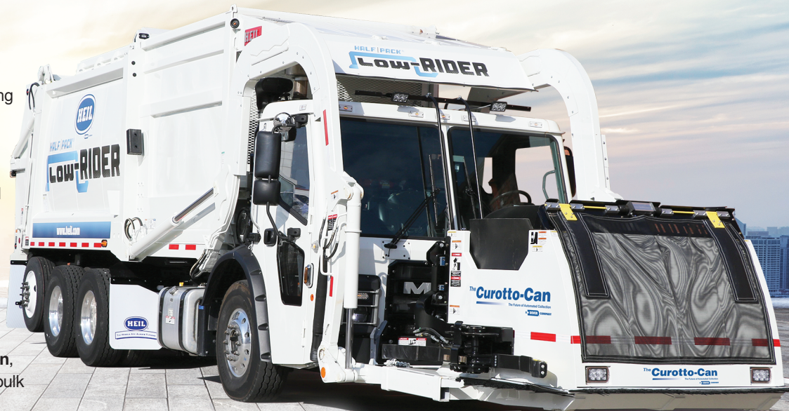
Shown with optional Half/Pack® LowRider™ Body and Curotto-Can® Residential Package

* Heil does not provide tax advice. Please consult your tax advisor regarding the specific tax implications of your selected product.