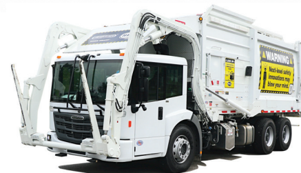
Available with articulating arms for EconicSD chassis