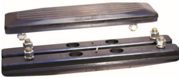
Standard bolt on pads bolt directly onto the grouser

Roadliner pads require the steel grouser to be removed and the pads bolt directly to the chain.