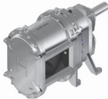
CL266 Rotary Pump

Motor power: 40 hp Input/Output speed: 1780/600 rpm Output torque: 7859 lb-in Service factor: 2.8 Mode of operation: Cont.-S1 Insulation class: F Enclosure: TE-IP55 Voltage: 230/460V, 60 Hz (50 Hz Available) Rated current: (460V) 47 A Output shaft: Diameter = 2.500 inch.; Length = 5.00 inch Weight appr.: 796 pounds without options Lubricant: MINERAL OIL ISO VG220, ca. 6.87 quarts (6.5L) Coatings: Electroless Nickel coated Gear design: Foot mounted (B3) Gear box options: 2WD, Quadrilip seals Motor options: CUS: UL/CSA-standard, HE: Energy efficient motor