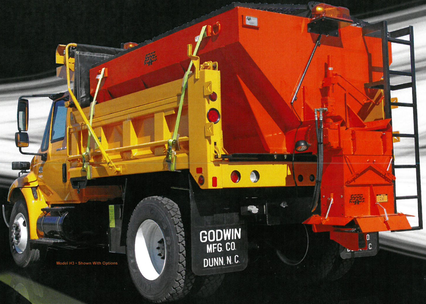
Model H3 - Shown With Options

America's Original Snow Equipment Manufacturer