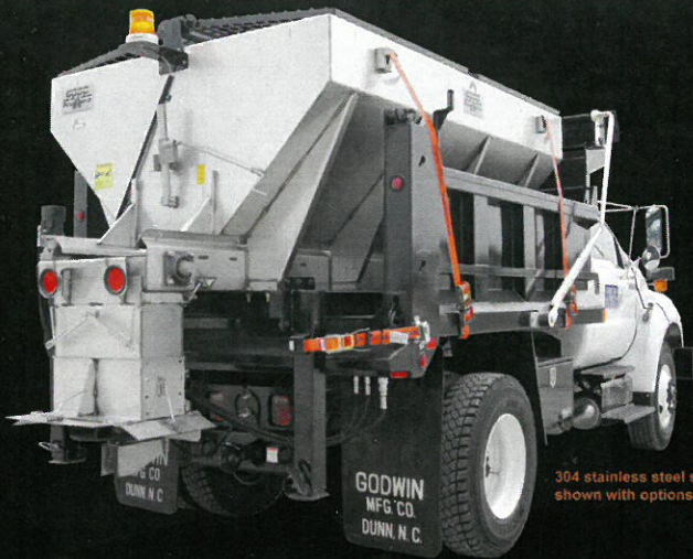
304 stainless steel spreader shown with options.