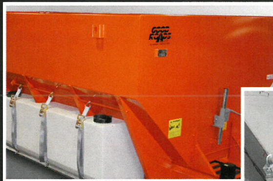
All photos show various optional equipment.