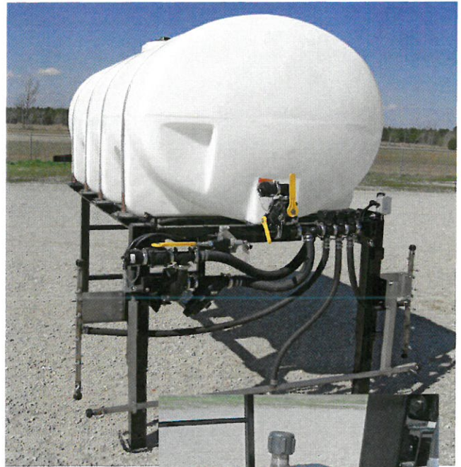
Unit in photos shown with options