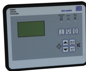
DGC-2020 DIGITAL CONTROLLER