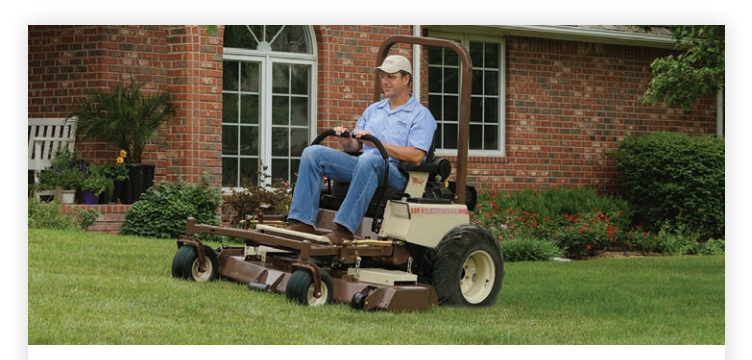
Featured Model 225 with 52-inch DuraMax® deck