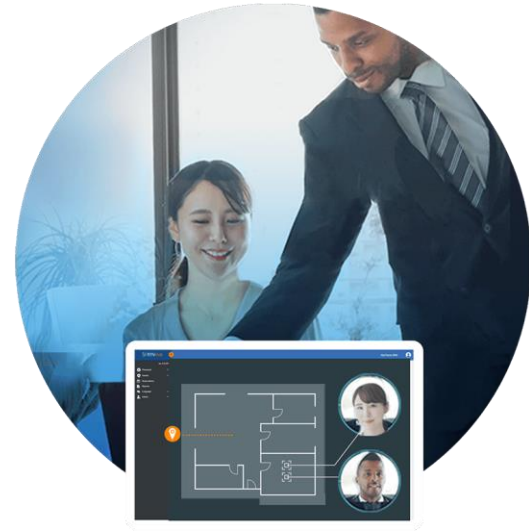
RTN WORKPLACE SAFETY