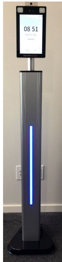
Floor Mount with 5-inch stem (pictured). Approx. total height = 56 inches