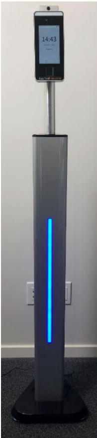
Floor Mount with extended stem (approx. 9"). Approx. total height = 59 inches