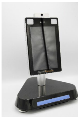
Desk Mount with 5-inch stem (pictured). Approx. total height = 14 inches