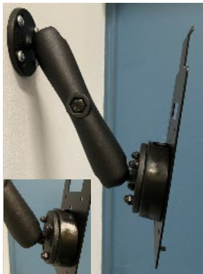
HT5008 - WALL OR DESK MOUNT KIT

Wall plate and adapter combination that allows for an adjustable angle vertically and horizontally.