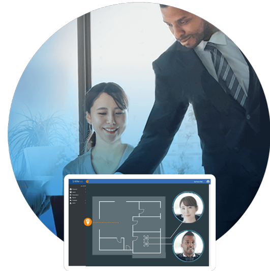
RTN WORKPLACE SAFETY