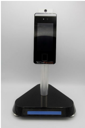
Desk Mount with extended stem (approx. 9"). Approx. total height = 17 inches