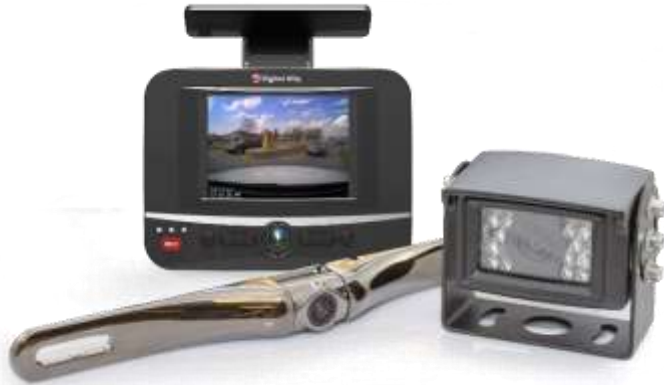
Fleet 250 System